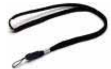
Neck String Add $0.20 ea