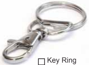
Key Ring Add $0.30 ea