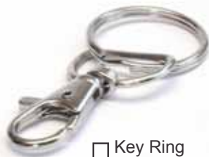
Key Ring Add $0.30 ea