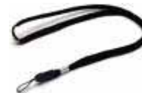
Neck String Add $0.20 ea