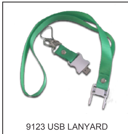
9123 USB LANYARD